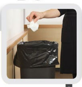
Dispose of soiled tissues in the trash.